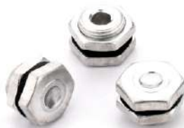
25) Commercial Valve (30 Ltr to 190 Ltr) Jumbo