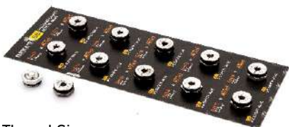
27) Stainless Steel Valve Pack-10 (Round type)