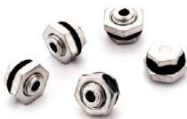
22) Small Valve