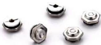
24) P. Regular (Plain)