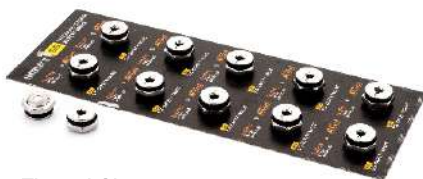
28) Stainless Steel Pack - 10 (P Type)