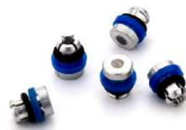
23) Slotted Valve