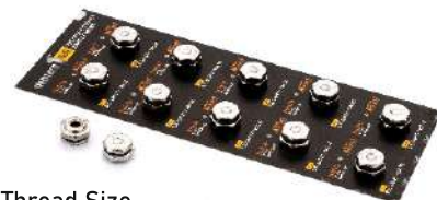
29) Stainless Steel Valve Pack 10 (Hex type)