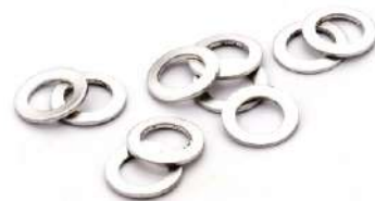
26) Aluminium Washer (Vent Pipe)